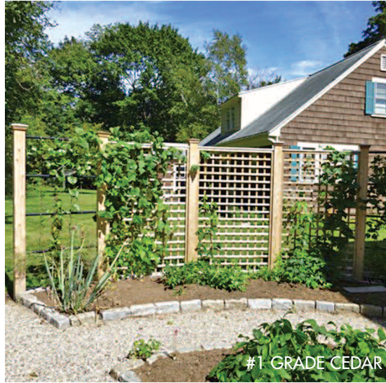
#1 GRADE CEDAR