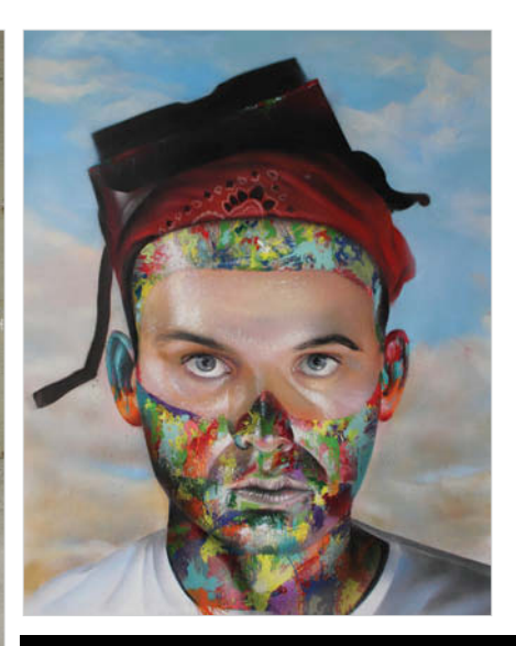
BUILDING A PORTAL TO THE CONTEMPORARY ARTS